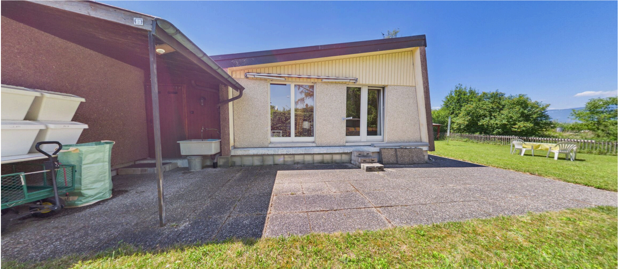
Terrasse Ost mit Zugang Allzweckraum; heute so