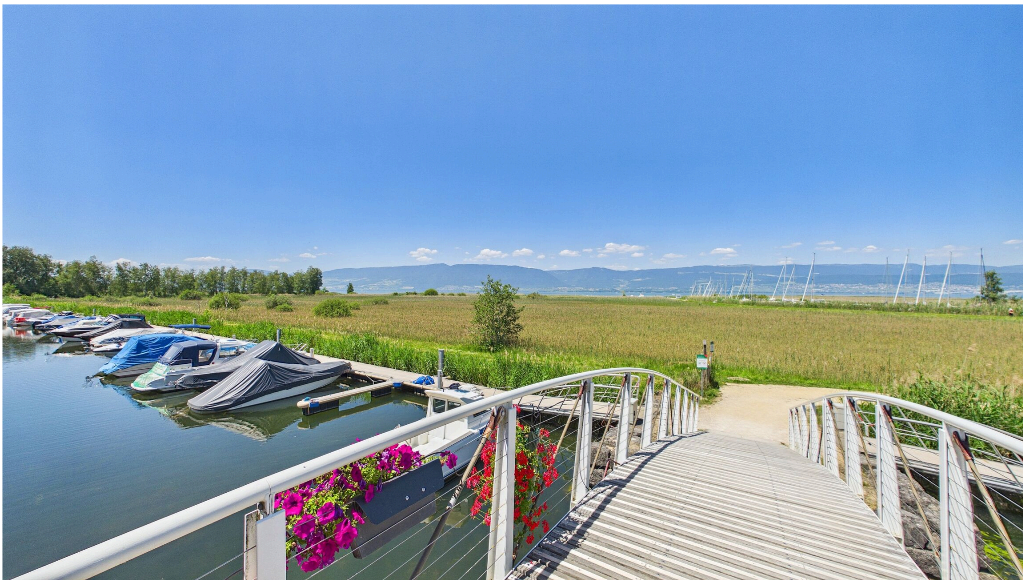
über die Brücke zum Sandstrand