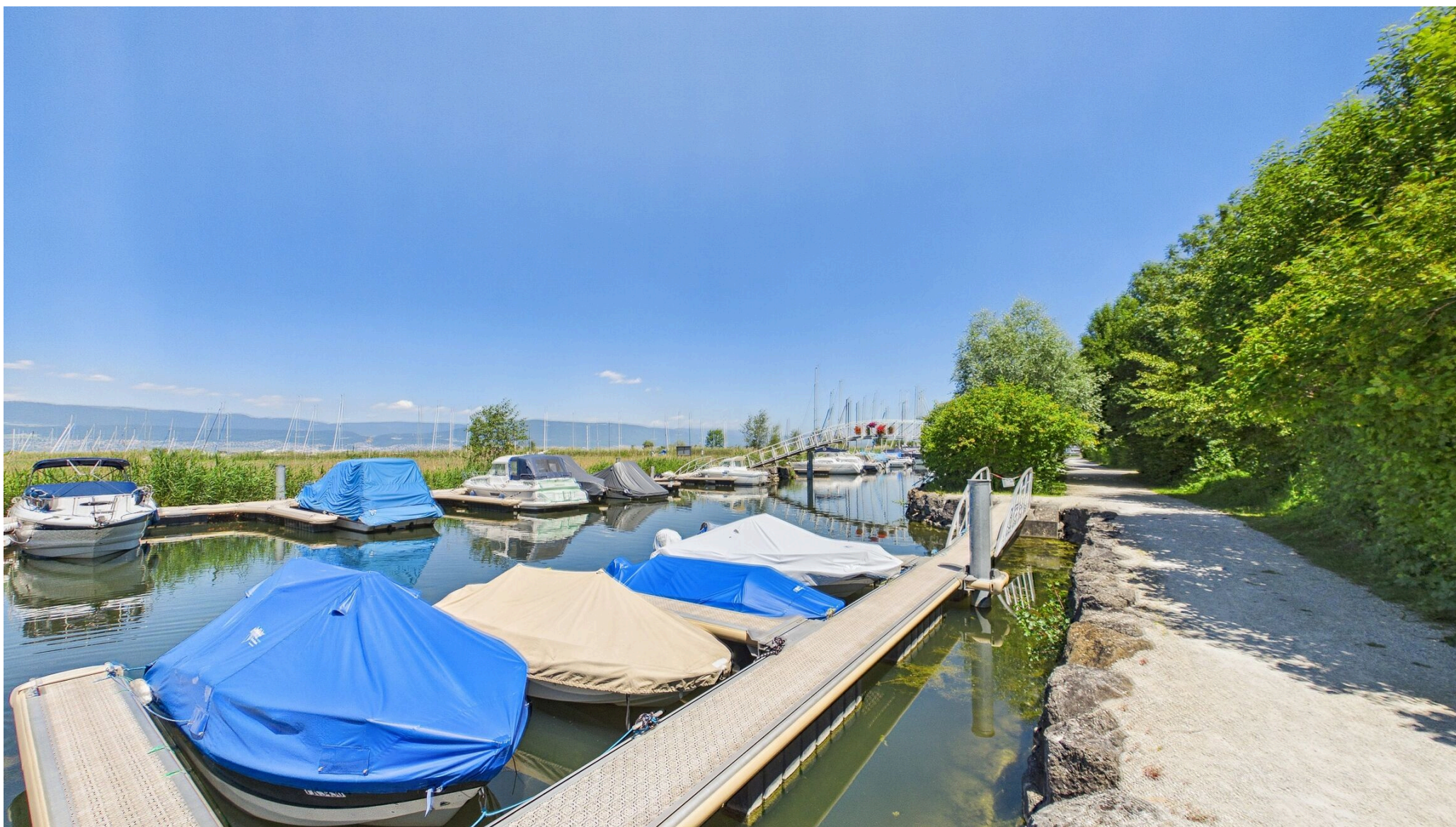
Vom Bootshafen auf dem Gehweg