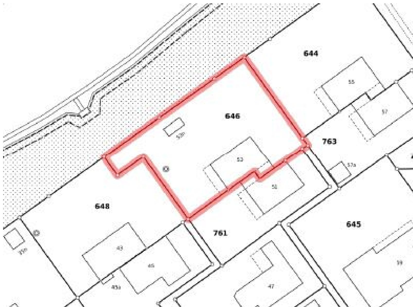
Parzelle Nr. 646 mit 739m 2