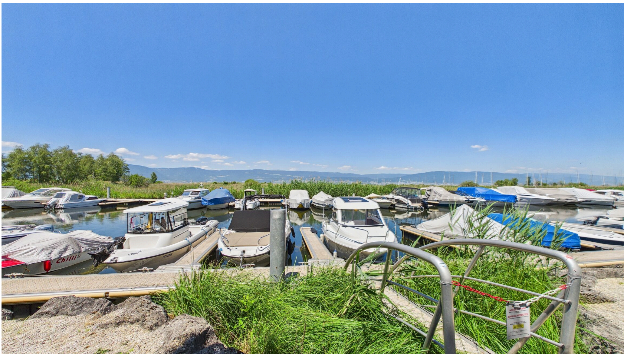
Durch den Garten nach 10 Metern am Bootshafen