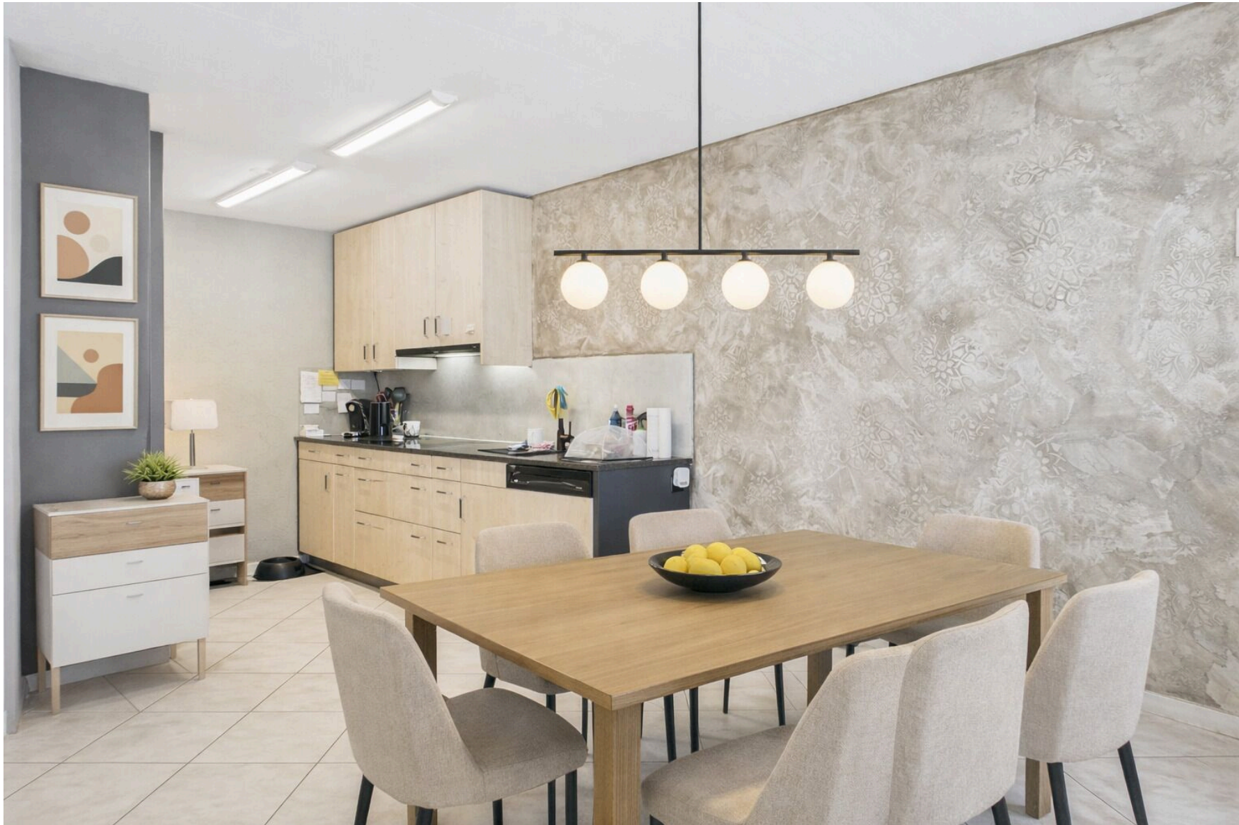
Essbereich und Küche