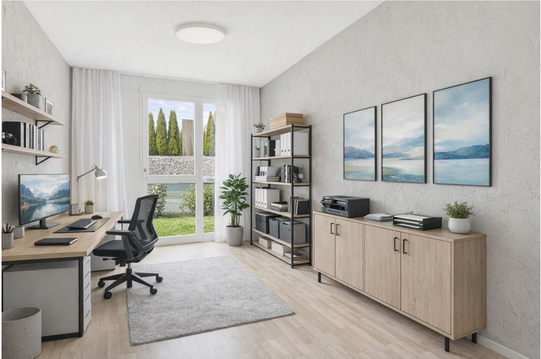
Zimmer 2 mit Möblierungsbeispiel